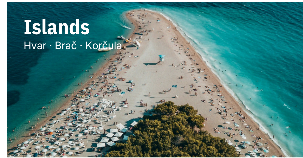
Islands Hvar · Brač · Korčula

We also place students in Zadar, Šibenik, Rovinj, Poreč, Makarska and 100+ islands . Language-matched placements mean Italian speakers go to Istria, German speakers to areas with strong German tourist flow.